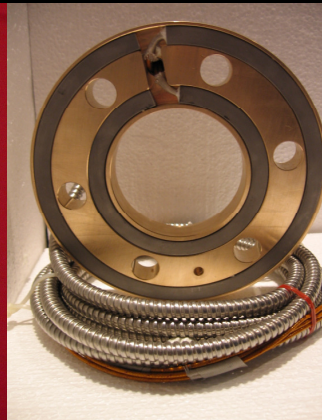
PG500 Pressure Indicator